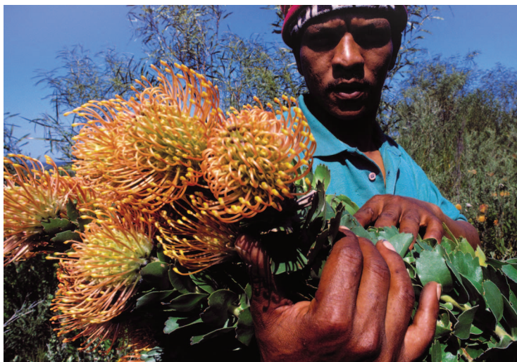
Fig. 2. A flower collector in Flower Valley, South Africa, harvesting pincushions ( Leucospermum spp.) as part of a sustainable use initiative. Sales of sustainably harvested wild fynbos flower bouquets help to subsidize the conservation costs of the site.

Despite these efforts, biodiversity loss is not slowing down. Recent assessment shows a continued, steady overall decline in wild species' population