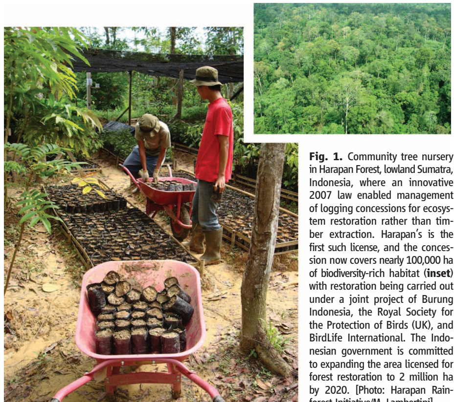
Fig. 1. Community tree nursery in Harapan Forest, lowland Sumatra, Indonesia, where an innovative 2007 law enabled management of logging concessions for ecosystem restoration rather than timber extraction. Harapan's is the first such license, and the concession now covers nearly 100,000 ha of biodiversity-rich habitat (inset) with restoration being carried out under a joint project of Burung Indonesia, the Royal Society for the Protection of Birds (UK), and BirdLife International. The Indonesian government is committed to expanding the area licensed for forest restoration to 2 million ha by 2020.

Yet biodiversity continues to decline, even though worldwide conservation efforts are increasing (1, 7, 12). In this article we review the scope and achievements of these efforts, and outline the key challenges that we believe must be